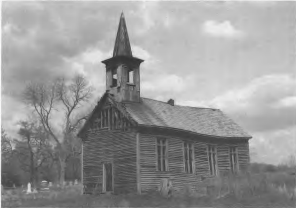
Leatherwood St. Patrick's, as it appeared in the Spring of 1992

ST. PATRICK'S MISSION OLD WASHINGTON AND LEATHERWOOD, GUERNSEY COUNTY 1846-1930